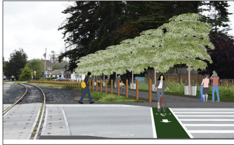
Drawing of Almar Westside courtesy of Santa Cruz County Regional Transportation Commission, 2017.

Phase I is 1.3 miles long, connecting neighborhoods to beaches, schools, work sites, shopping and restaurants. Friends of the Rail & Trail, together