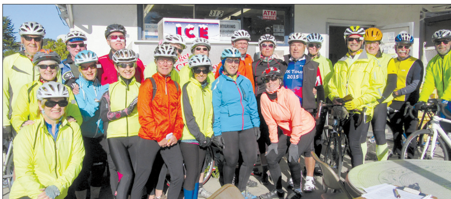
SCCCC begins Nov. 29 ride at La Selva Beach for journey to Watsonville