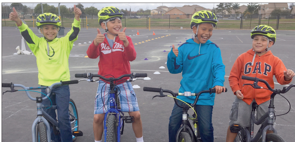
Four 5 th grade boys complete Bike Smart program at Loya Elementary School in Salinas.

Berenice is one of 2,574 elementary and middle school students who learned bike safety skills last year through Bike Smart, a program sponsored by Ecology Action under the directorship of Kira Ticus. Bike